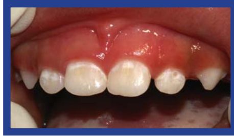
White Spot & Early Cavities